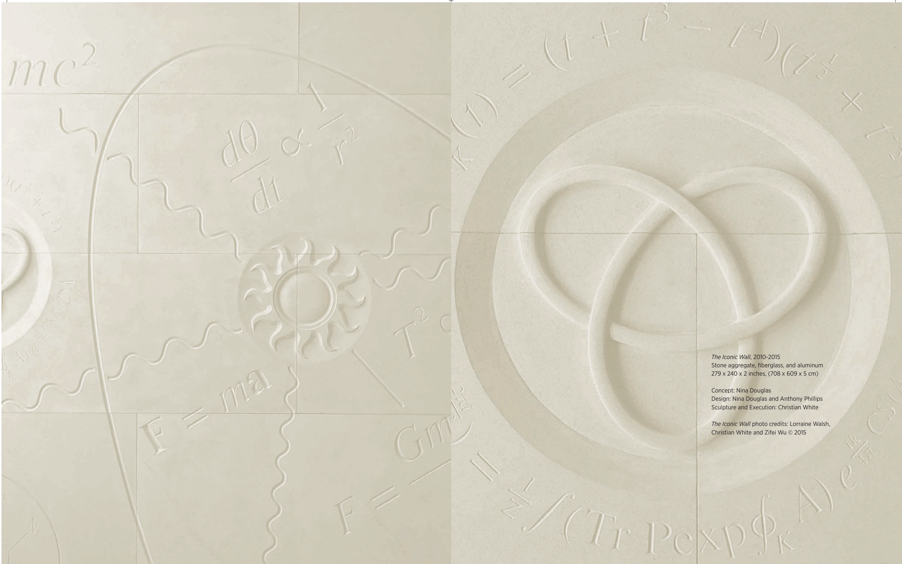
The Iconic Wall , 2010-2015 Stone aggregate, fiberglass, and aluminum 279 x 240 x 2 inches, (708 x 609 x 5 cm)