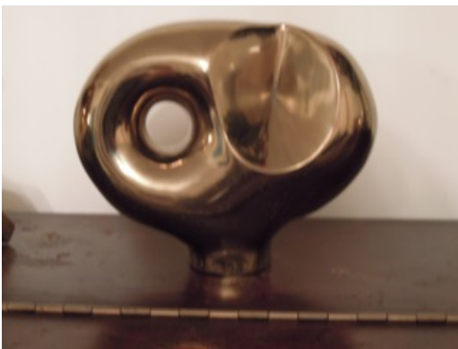
20. Torus with Crosscap