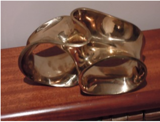
25. AMS Public Policy Award