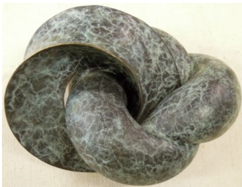
7. Umbilic Link