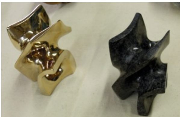
5. Invisible Handshakes