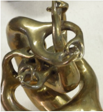
10. Alexander's Horned Wild Sphere