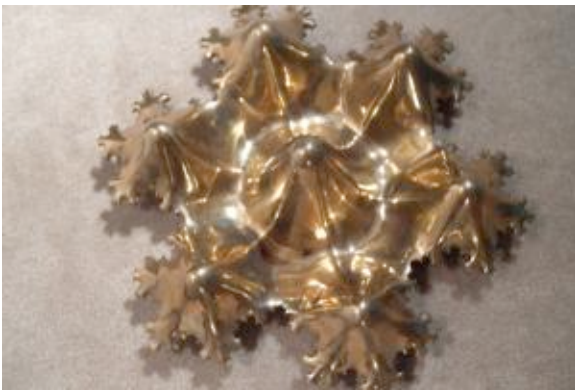
27 Texas Snowflake Laplace-Dirichlet, 13th