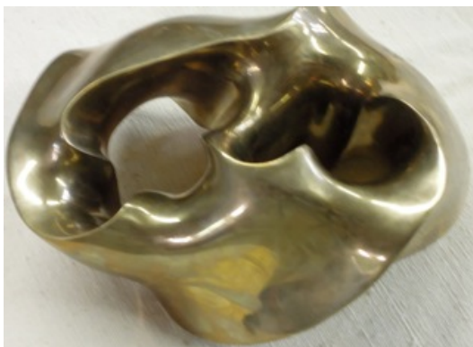
3. Figure Eight Knot Complement