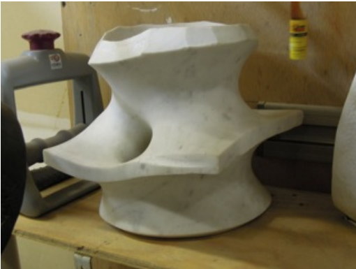
34. Costa IV