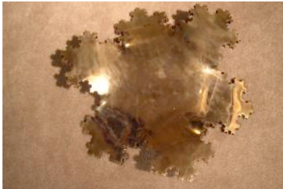
28. Texas Snowflake Laplace-Neumann, 6th