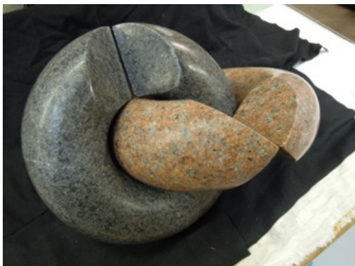
2a. Eine Kleine Link Musik