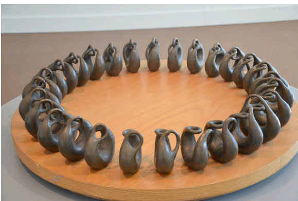
30. Double Torus Stonehenge: Continuous Linking and