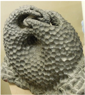
17 Cosine Wild Sphere