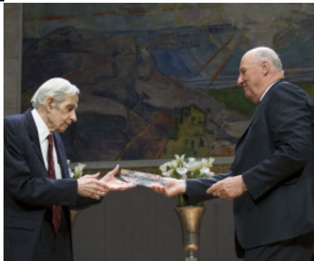
Abel Prize, 2015