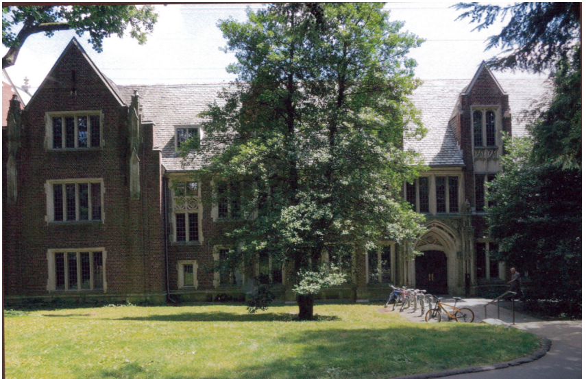
The old Fine Hall