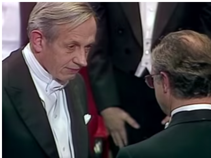
Nobel Prize, 1994